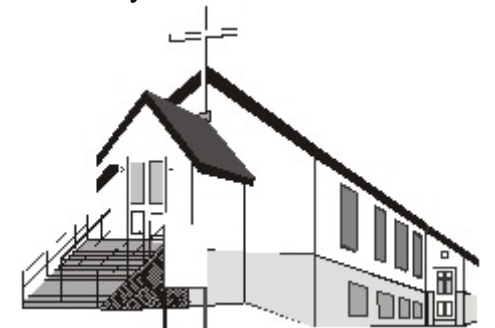
St. Peter's, Wabush

Our Bulletin for the month of July is given To the GLORY Of GOD and dedicated IN LOVING MEMORY of